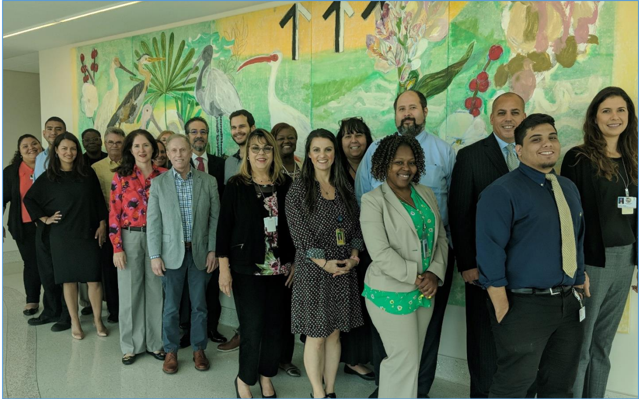
Group photo from June 7, 2019, advanced CME training in Miami-Dade County.